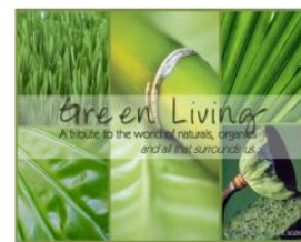
Green Living A closer look at the natural & organic market within the cleaning industry.