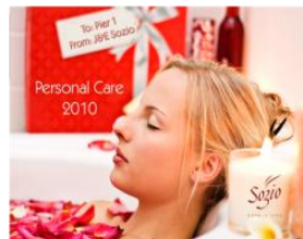
Personal Care 2010 A up close & Personal look at the Personal care Market...