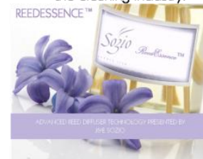
ReedEssence™ An in depth look at our most recent developments within the Reed Diffuser market.